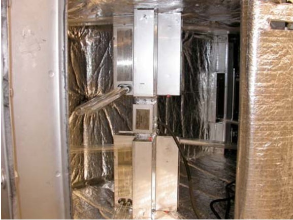
Figure 2-1. Device installed inside the test rig. Front unit shown through door of test rig.